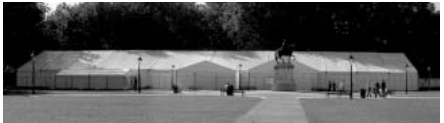
Marquee in Queen Square, Bristol